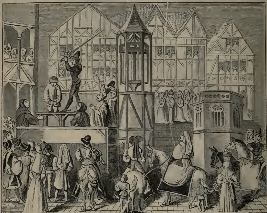
EXECUTION OF AYMERIGOT MARCEL AT PARIS. FROM MS. Froissart of the fifteenth century.

Berry hates me mortally, but, through your means, I will make my peace ; for, dead or alive, you shall be given up to him, and never, on any other account, shall you leave this castle." This speech astonished Aymerigot, who replied,—“Why, Tournemine, I am your cousin. Are you in earnest in what you say ? or do you do it to try me ? I came hither, in full confidence, to see you and ask your advice, and I meet with this cruel and harsh reception.” “I know not what you proposed for yourself,” answered Tournemine, “but I shall certainly execute what I have intimated to you,” and then laid hands on him : his servants, who knew what they were to do, advanced and seized him. Thus was Aymerigot taken without a possibility of making any defence ; for, as I have said, he had disarmed himself ; nor could any entreaties prevent Tournemine from ordering him heavy fetters on his legs, and causing him to be confined in a strong tower under safeguards.